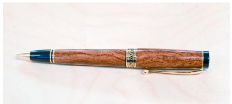
The finished demo pen