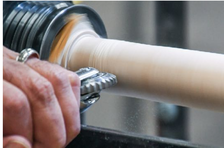
Spiralling with the Sorby tool