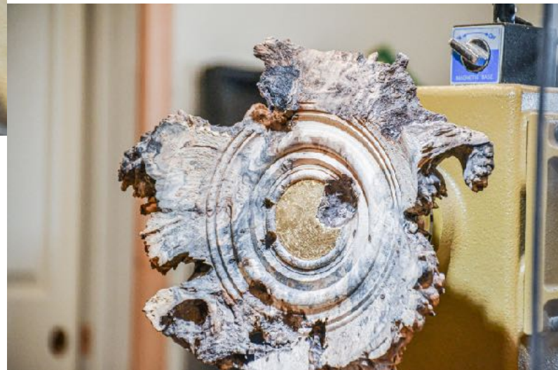
The Finished Piece