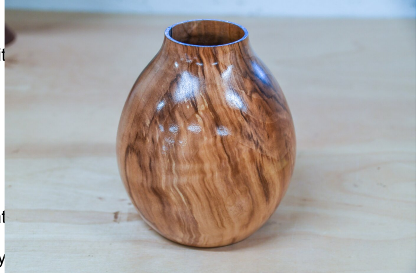
The final shaping of the vessel