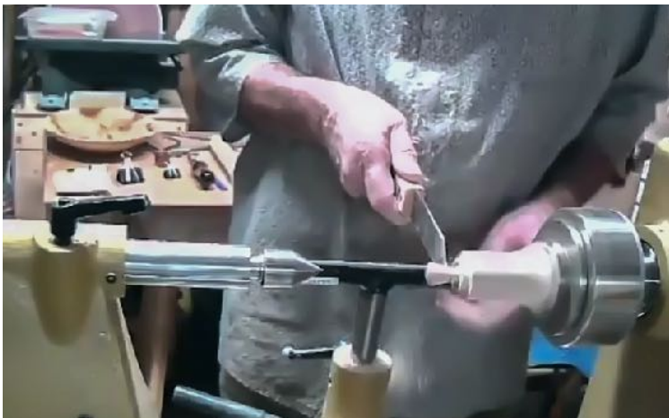
Parting off the Top Knob