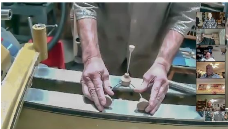
The finished stand