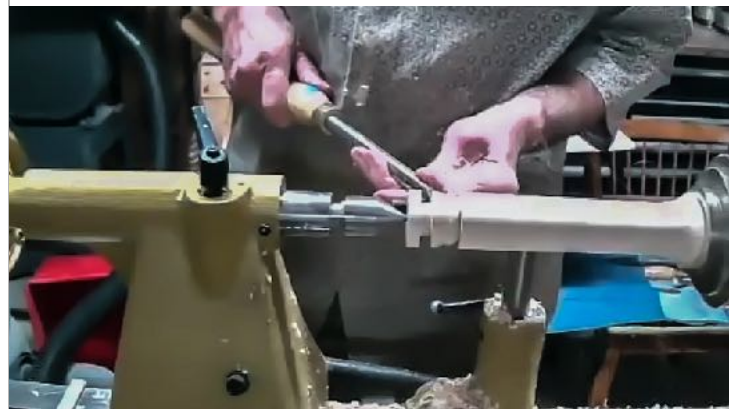
Turning a groove for the plate to sit on

Thanks to Chuck for another wonderful demo.