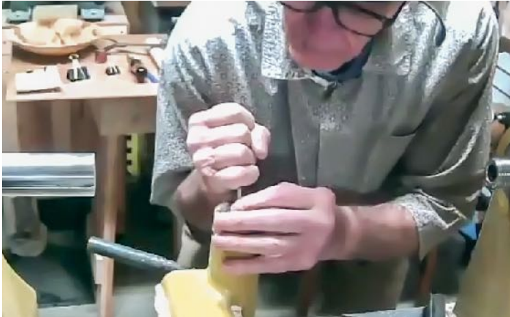
Chuck's High Tech Wire bender