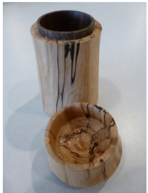
All from Chuck Kuether