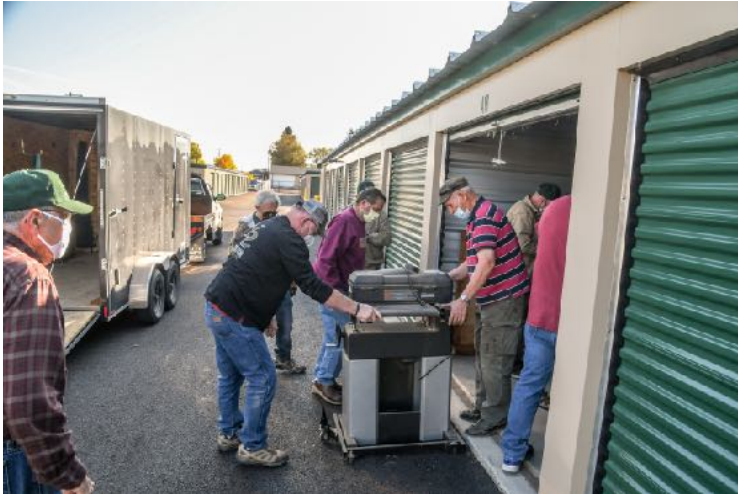
Many Hands Make Short Work of the Move