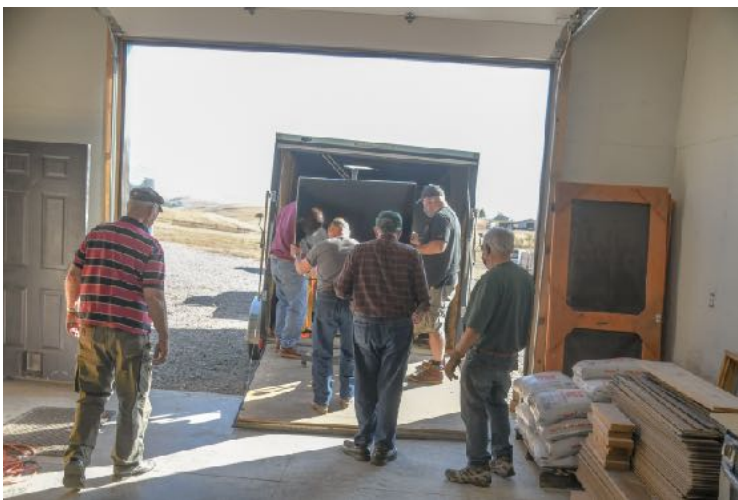
Unloading in. Our New Home