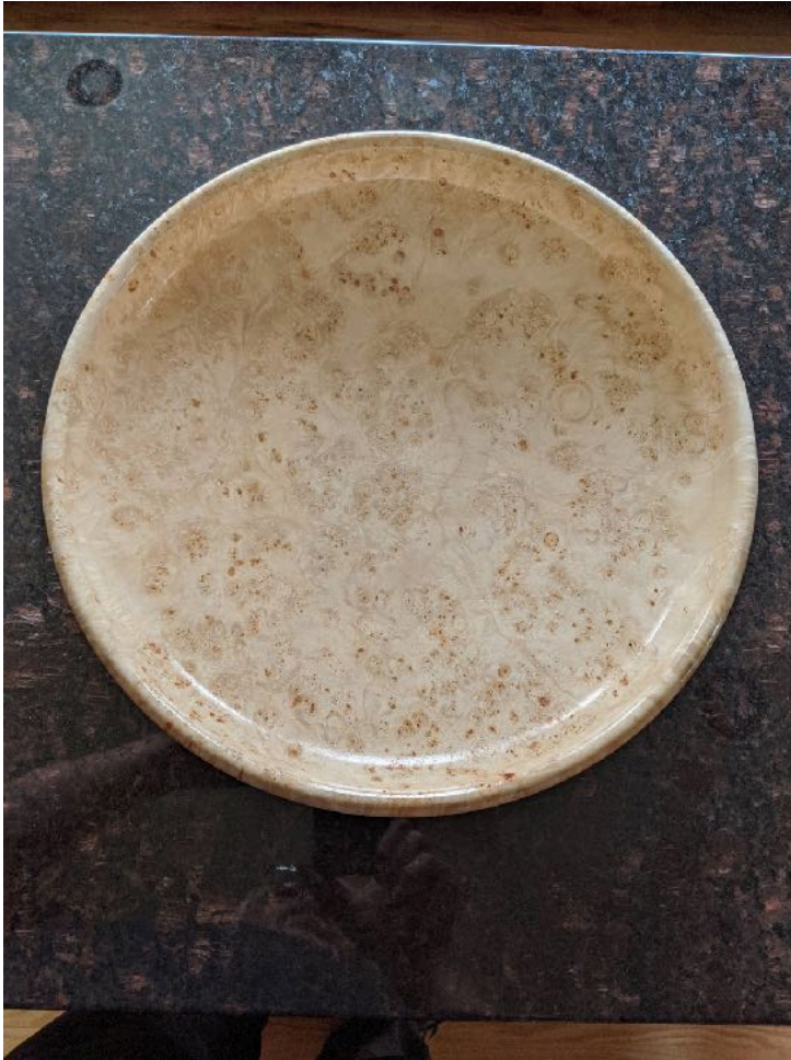
Box Elder Burl Bowl