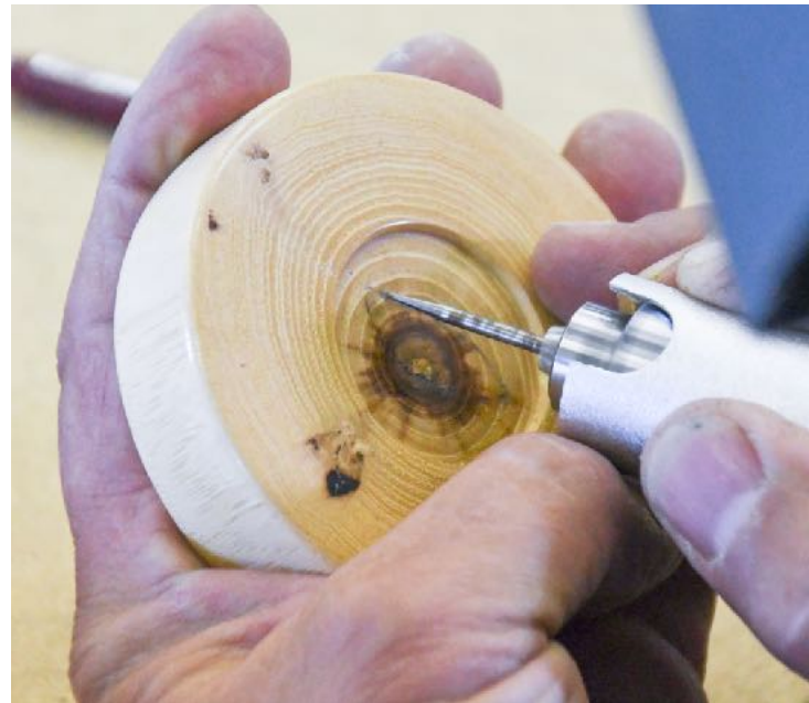
A steady and and lots of patience are needed for this project.