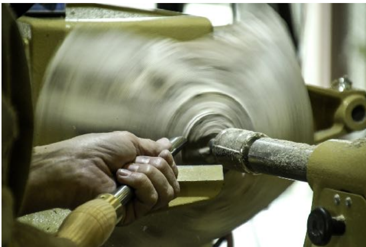
A tenon is cut to mount the blank in the chuck