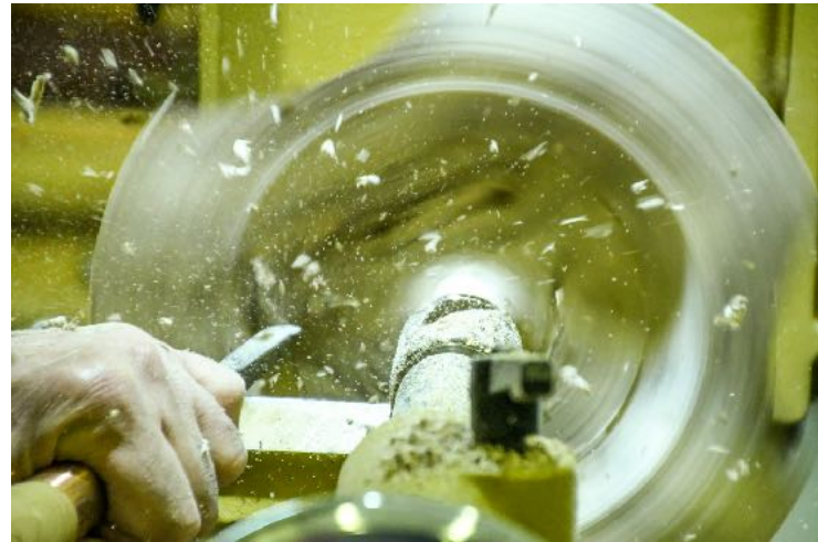
After sanding, the blank is reversed and the bowl is hollowed out.