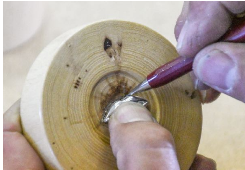
Checking the fit of the insert and marking areas still needing some attention.