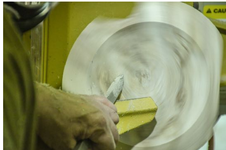
Making the finishing cuts.