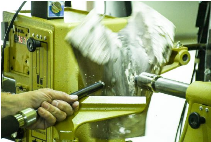
Starting to thin and shape the back side of the blank.