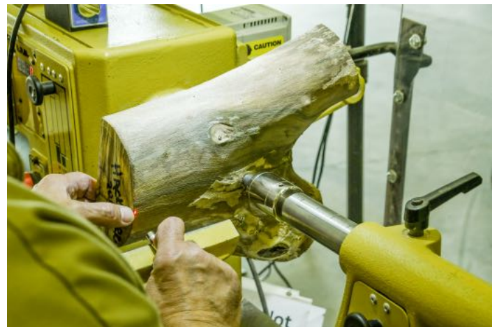
The laser used to center the blank