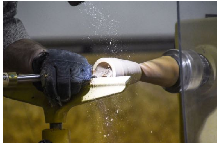
Hollowing out the top

After making a tenon on the end for mounting the middle of the piece is sized before turning to intended shape.