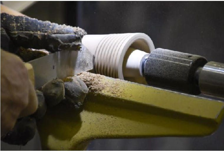
A narrow parting tool is used to make the grooves.