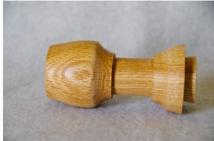
The napkin ring jig

drilled in the center. Turning the ring is very straight forward after the jig is made.