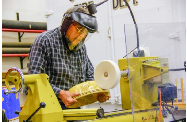
Buffing a bowl to bring out the shine