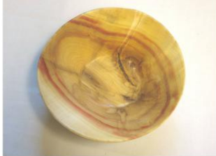
Box Elder Oriental Rice Bowl