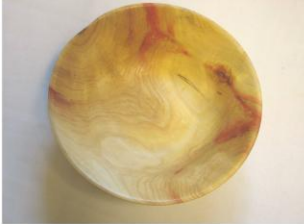
Box Elder Oriental Rice Bowl