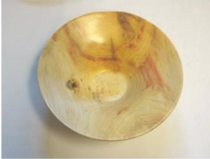
Box Elder Oriental Rice Bowl