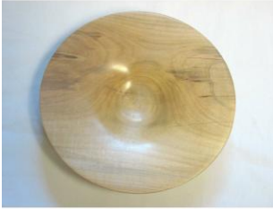
Maple Oriental Rice Bowl