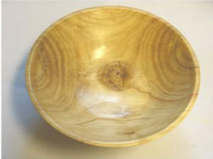
Box Elder Oriental Rice Bowl