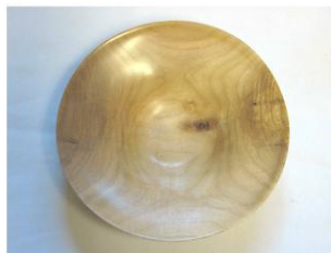
Maple Oriental Rice Bowl